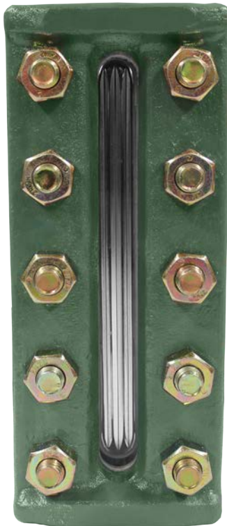
Model 3520 Reflex Liquid Level Gauge

The model 3520 glass liquid level gauge is a rugged flat glass gauge. Standard construction includes a solid one-piece chamber,