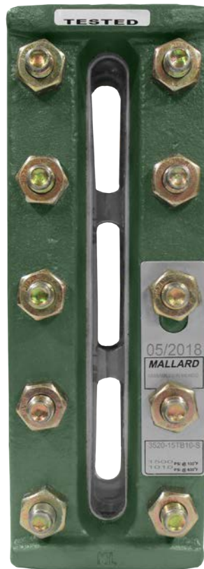
Model 3520 Transparent Liquid Level Gauge

steel covers, alloy steel bolts and nuts, and tempered glass.